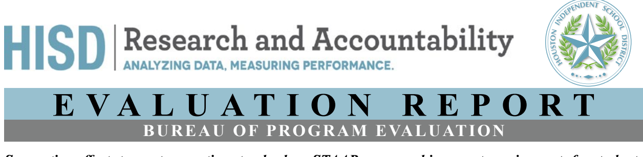
Supporting efforts to meet promotion standards or STAAR course achievement requirements for students who attended the Summer School Education Program, 2021–2022